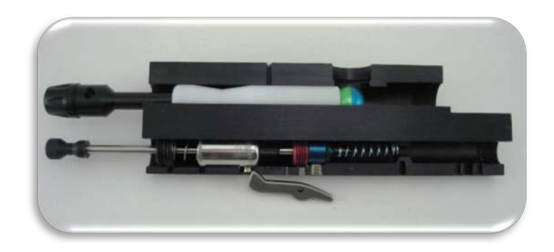
Sear Engaged, Bolt moving forward ball entering the chamber.

The ball is temporarily held in place by the ball detent installed in your T2 marker (It is hidden under to top tube and protrudes into the breach. When the hammer clears the sear, the sear will catch (with a click).