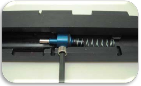
Cutaway view showing removal Valve Retaining Nut Set Screw.

15. Insert an Autococker® Valve Tool into the rear of the bottom tube until you feel it seat deeply on the Valve Retaining Nut and remove it. Because