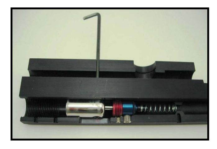
Lug adjustment shown in cutaway. Lug is at its highest point.

Turn the Allen key clockwise to lower the lug (allow the marker to fire with a longer trigger pull – or during auto trigger – later in the cycle) and to the anticlockwise to raise the lug (allow the marker to fire with a shorter trigger pull - or during auto trigger - earlier in the cycle).