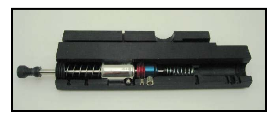
The light Valve Spring and heavier Main Spring force the valve open when not aired up.

This is normal and caused by CCM's use of a very light valve spring.