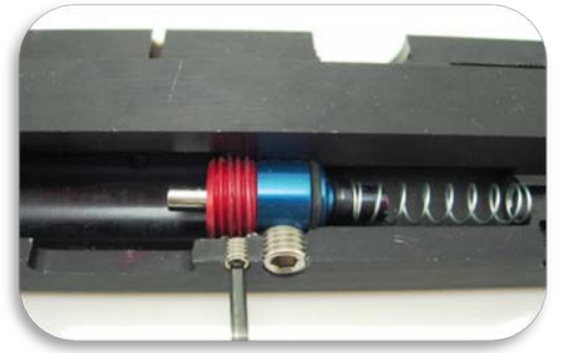
Cutaway view showing removal of Valve Retaining Nut Screw.