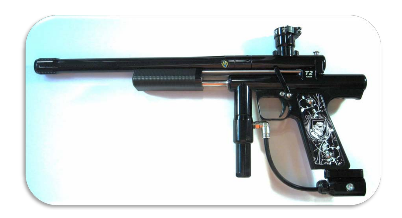
The <sup>Un</sup>official Manual of the Chipley Custom Machine T2 Pump Marker