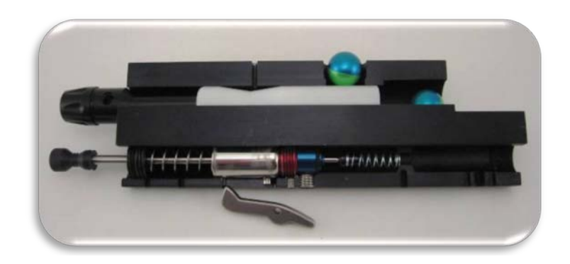
Series 5 Cutaway Sear disengaged, ball being propelled out of the barrel.

When you pull the trigger a sear is lowered which releases a hammer (inside the bottom tube of the marker). This hammer is under spring pressure (you load a spring when you pull back the cocking rod or pump the marker). The hammer strikes a valve, which allows gas to flow through the valve, up through the bolt, and down the barrel, propelling a ball (if loaded) out of the barrel.