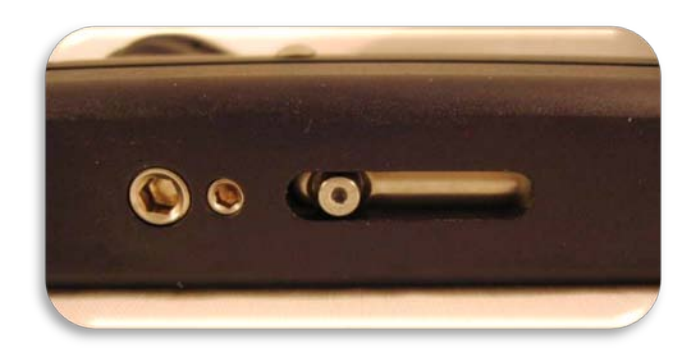
This is a Series 5 – but the principle is the same.

10. Note the depth of the Lug before disassembly. You want to replicate this depth upon reassembly. It will make timing the marker much easier.