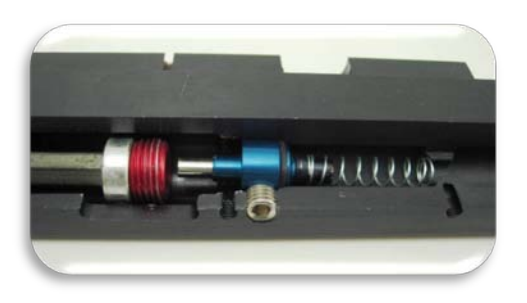
Cutaway showing Valve Wrench removing Valve Retaining Nut.

16. Carefully dump out the Valve, Valve Seal, and Valve Spring. Sometimes a few taps on a soft surface are necessary.