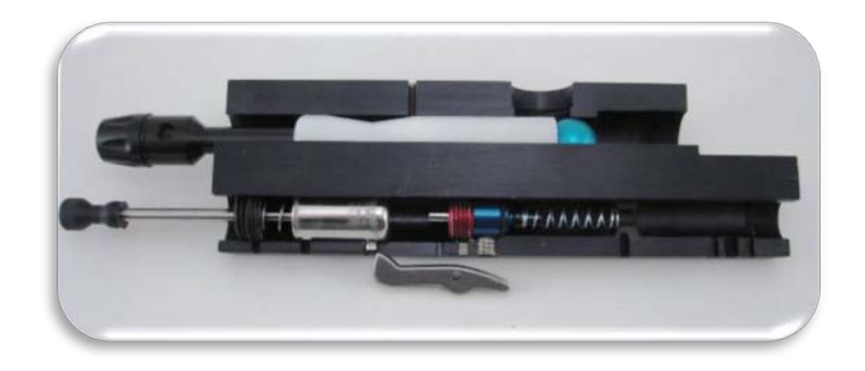
Sear Engaged, Bolt at rest, ball in chamber.

At this point, move the pump forward (away from the rear of the marker). This will move the bolt forward, which will push the ball past the detent and into the barrel of the marker.