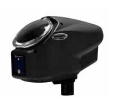
Halo Too Loader