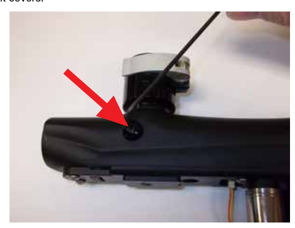
Note: Be careful not to lose any of the detent parts as they are small.