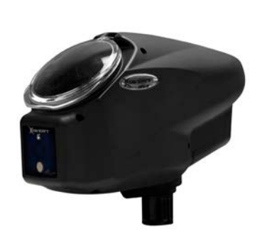
Halo Too Loader