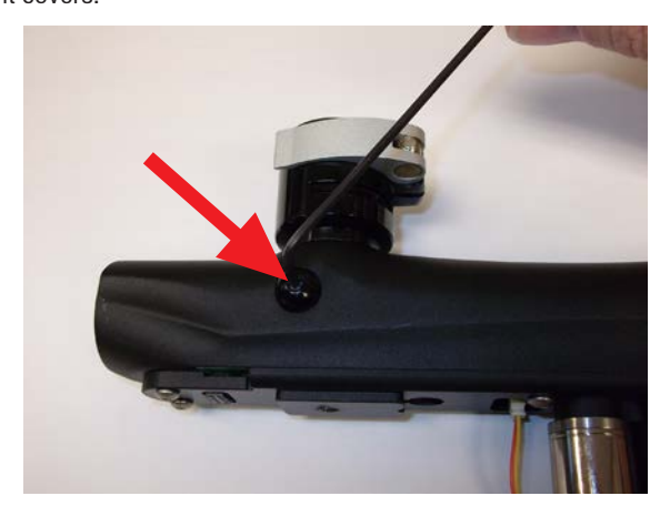
Note: Be careful not to lose any of the detent parts as they are small.