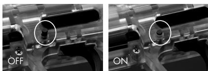
X-Ray Goggle Figure. 1

El dispositivo de bloqueo del cañón debe estar instalado en todo momento cuando el marcador no está siendo disparado, junto con