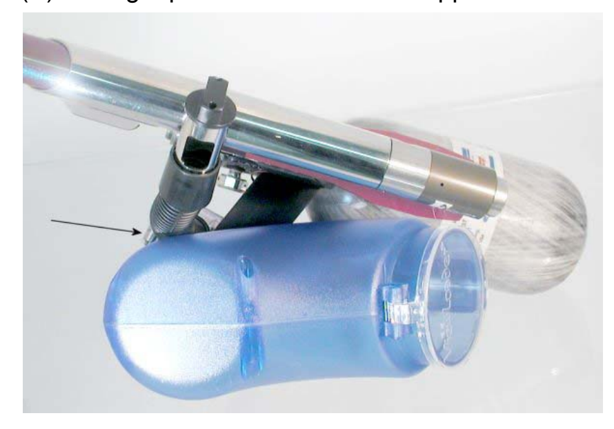
The feed hose limiting the parallel positioning of the hopper