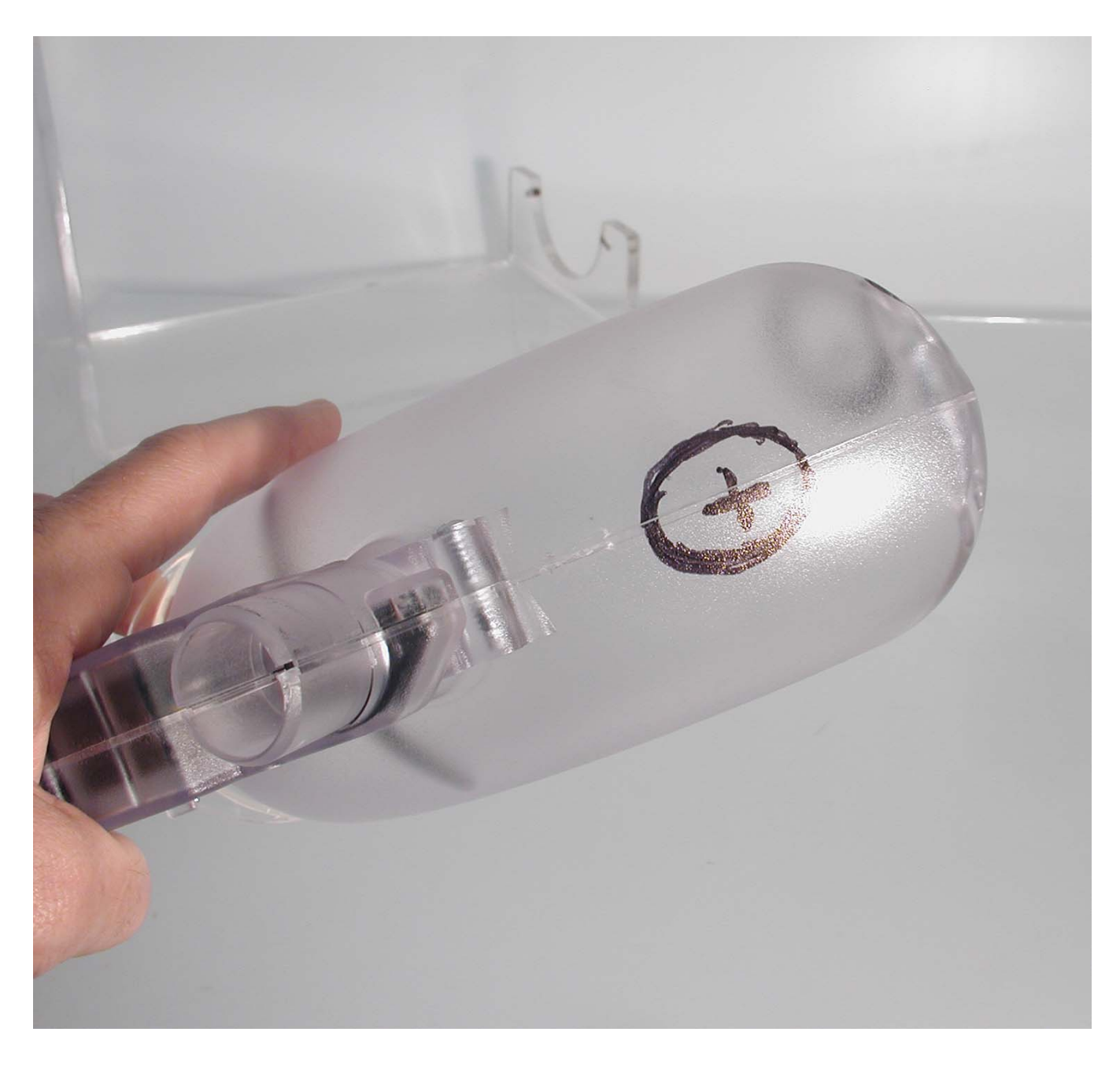
The width of the feed hose is just under one inch. Because the surface of the hopper is curved, the entrance hole will have to be elongated.