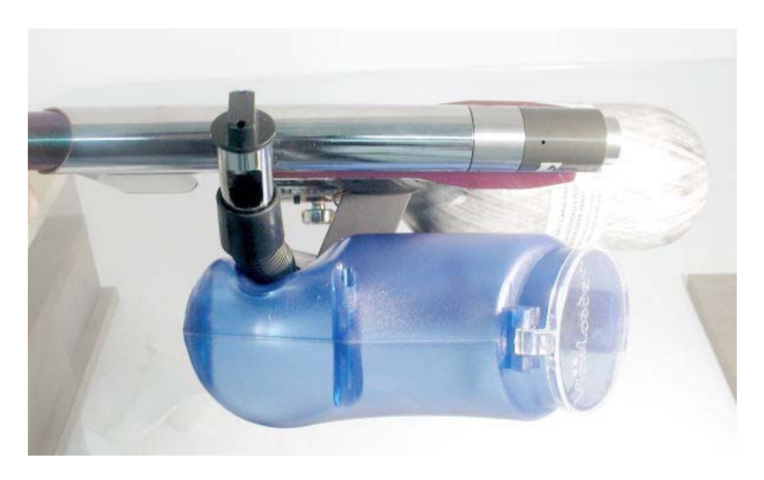
Now, let's look at option (B) Drilling a pass-thru hole in the hopper