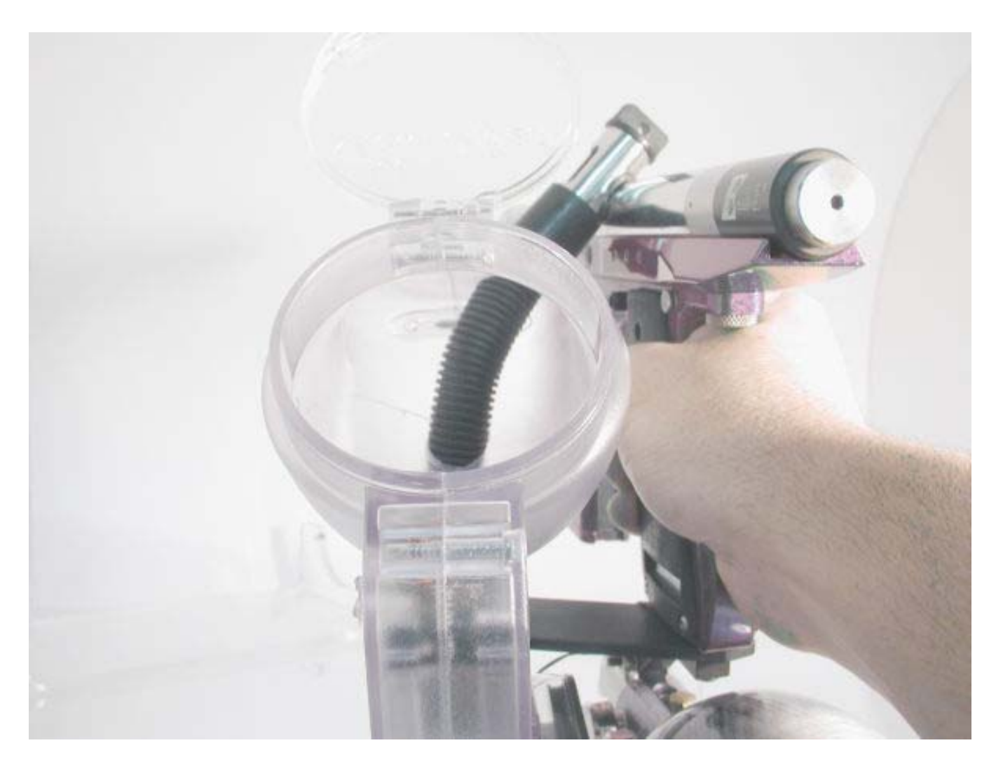
Wait till the blimp patrol gets some of this!