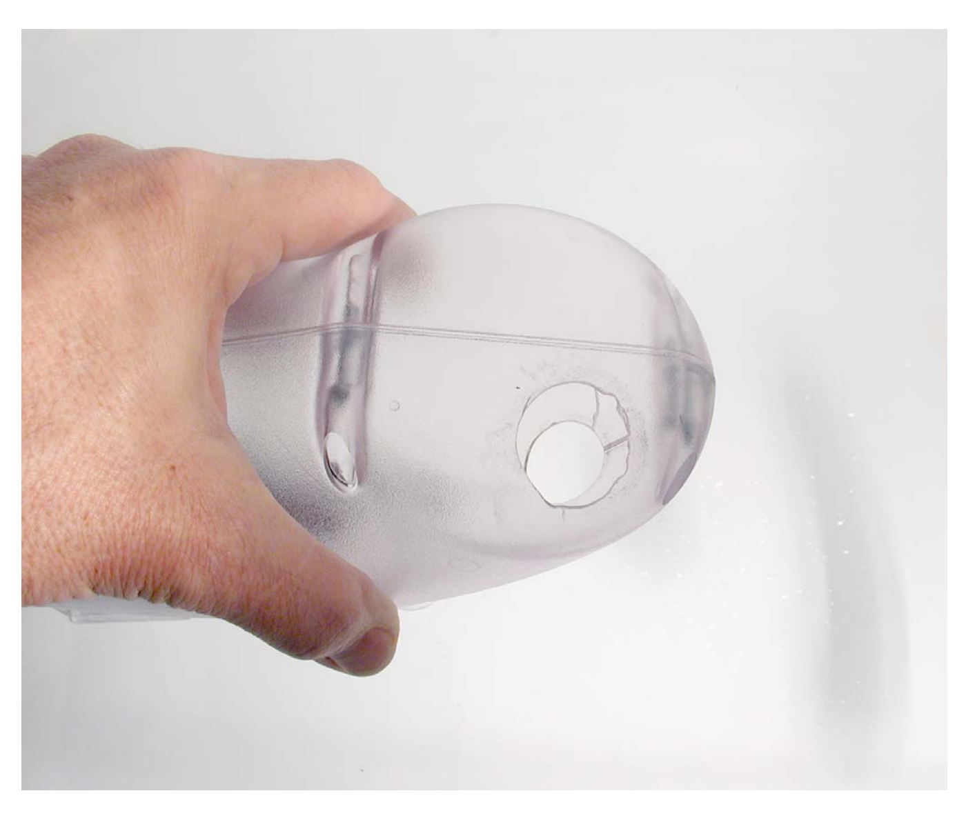
Remember, there is plenty of room for error, just less than the size of a paintball!