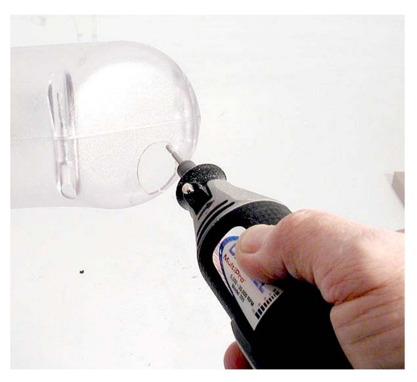
Keep checking your work until the hose will pass through in a direction towards the other hole. A little bit more of this side here and we'll have it!